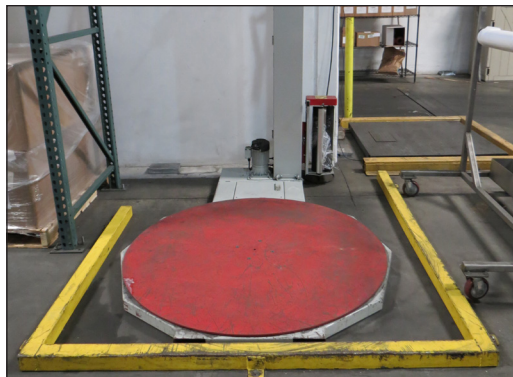
Bestpak Pallet wrapping machine