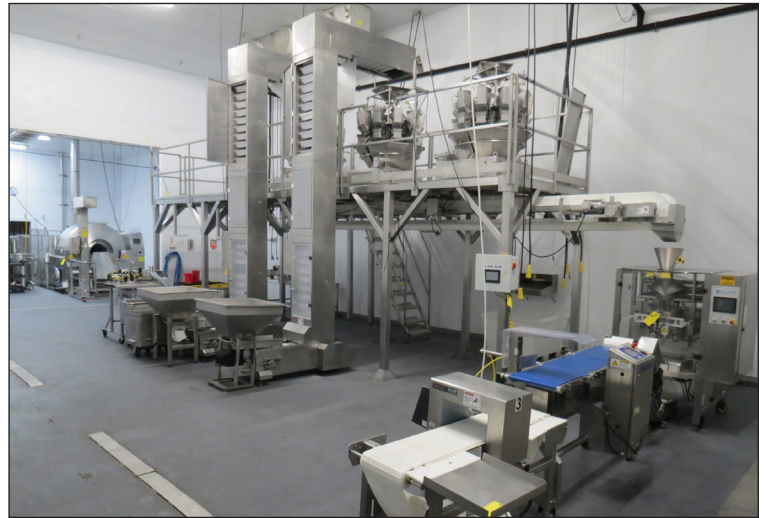
Ohlson 304 Stainless Steel 3-10 Head Scale Weighing Machine