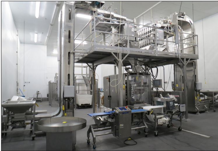
Cold Iron / Ohlson 2-20 Head Stainless Steel Weighing Machine

Machinery, Equipment and $3 Million Dollars of Food Product Inventory All equipment purchased new in 2017-2021