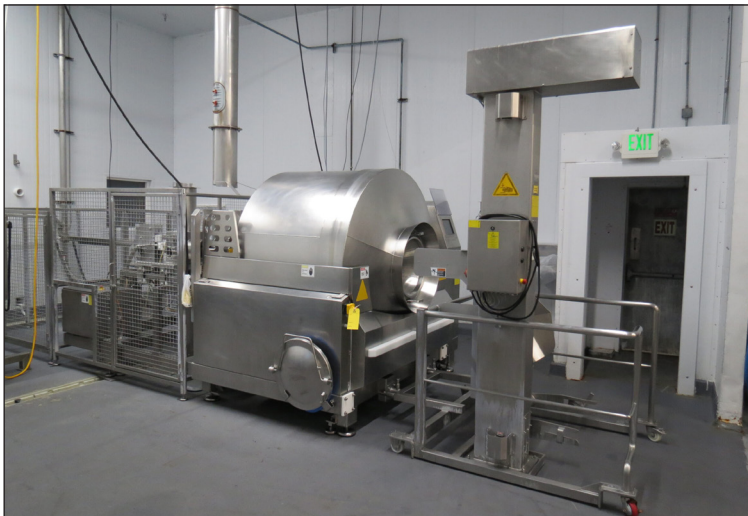
View of Dohmeyer Cryo Coating Tumbler