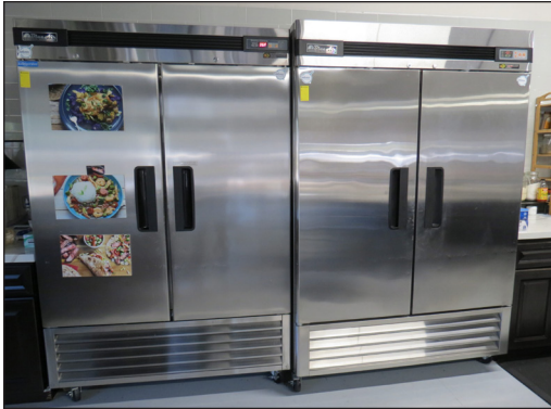
View of Blue Air Stainless Steel Refrigerators / Freezers