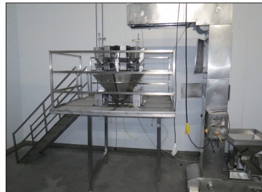
Weigh Pack Single Stainless Steel 10 Head