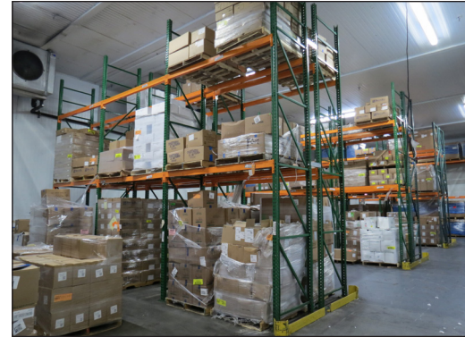
View of Cold Storage and Food Inventory