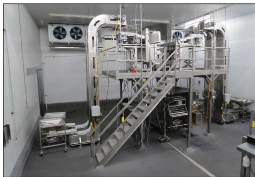
Triangle Weighing System