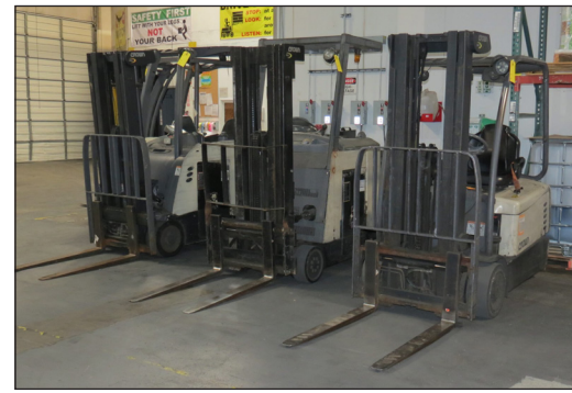
View of Crown SC200 Series Electric Sit Down Forklift