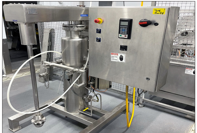
Scott Turbon Mixer