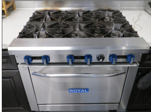
Royal 6-Burner Stainless Steel Stove