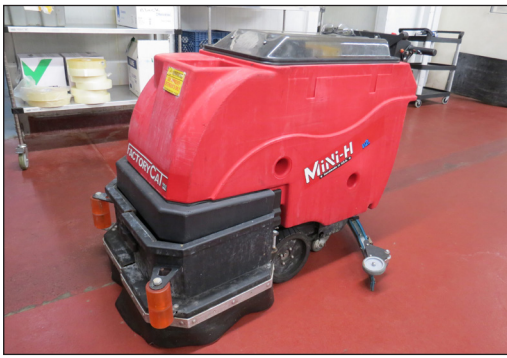
Factory Cat Mini HD V2.0 Electric Floor Scrubber