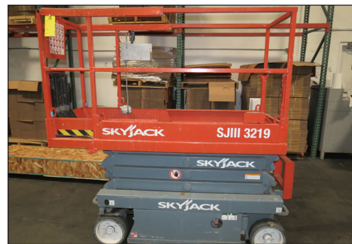
Skyjack Electric Scissor Lift