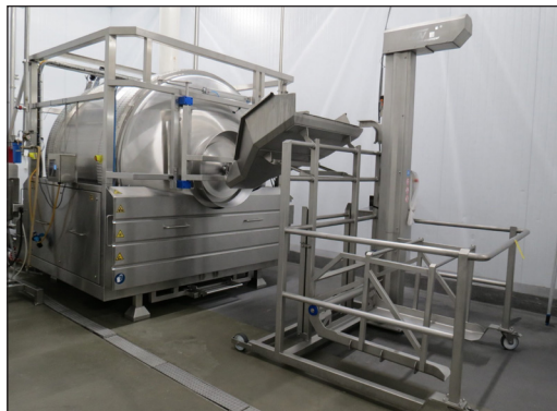
Dohmeyer Cryo Coating Tumbler