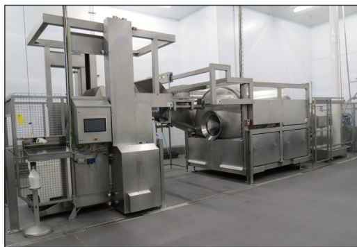
Gunther Tumbler, Model PGPC 7000 N2 with Direct Cooling, Safety Cage